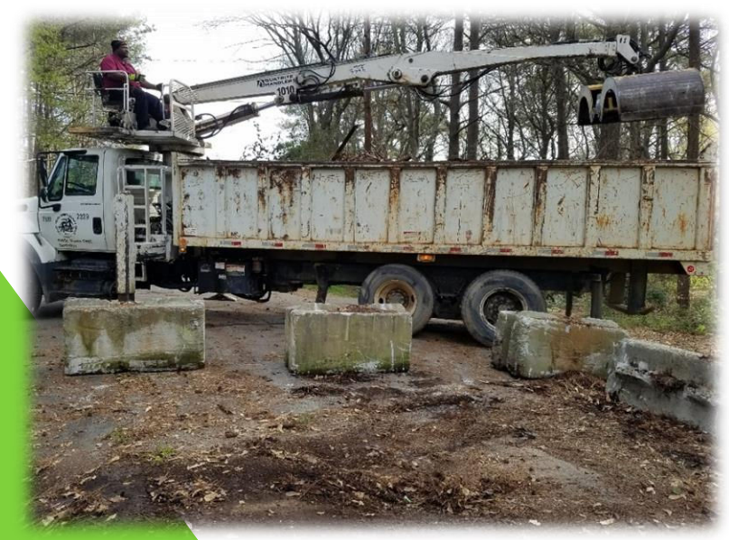
Pictured above is a crew cleaning up North Valleybrook Road and moving our barriers back in place to prevent future dumping.