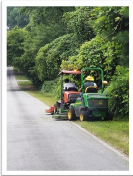
Crews work to mow New Snapfinger Woods Drive!