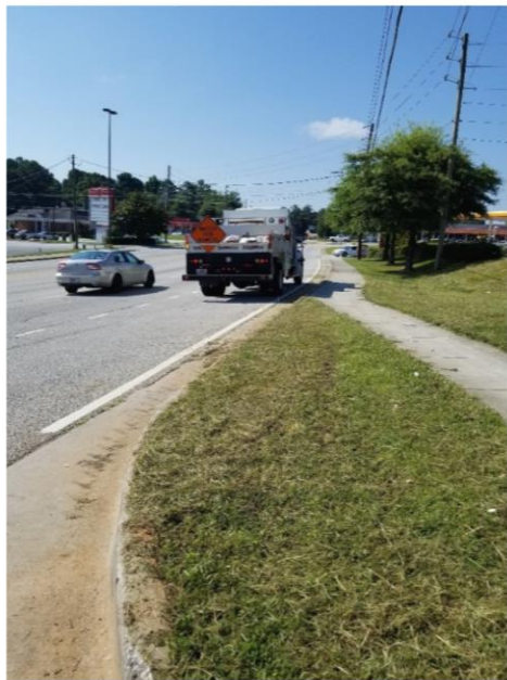
Mowing on Panola Road

Through the CEO's Operation Clean Sweep directive, tree trimming along county roads has received increased attention and resources this summer.