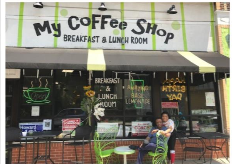
CITGO on Columbia Dr. between Rainbow Dr. and Glenwood Rd.; My Coffee Shop at East Lake on Memorial Dr.

The purpose of this program is to promote clean communities through strategic intervention with locally-owned/franchised businesses to reduce litter, promote attractive spaces, and facilitate easier maintenance. With this pilot program, the target area include the follow corridors along Columbia Drive: Memorial Drive; Rainbow Drive; and Glenwood Road.