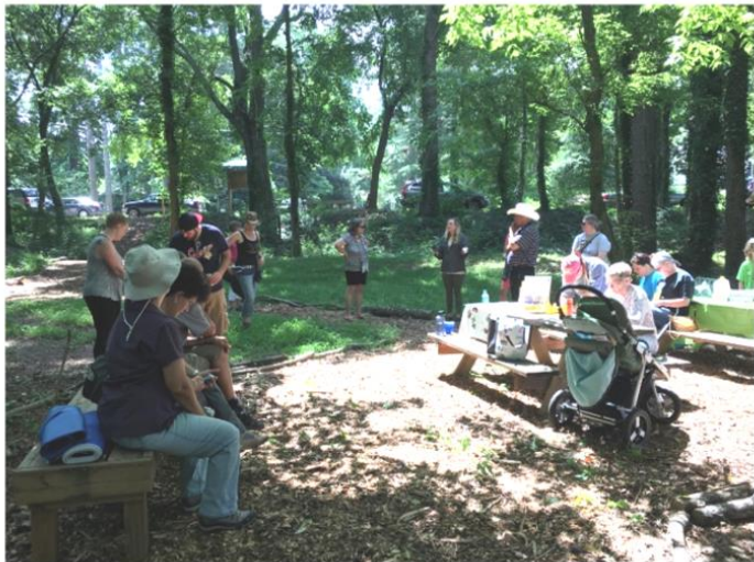
Little Creek Horse Farm Organizing their "Neigh"borhood

In June, volunteers removed 3,160 pounds of material from streets, streams and public spaces – That's the same as 400 full milk cartons!